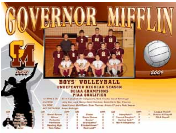
PAL 230 VLY