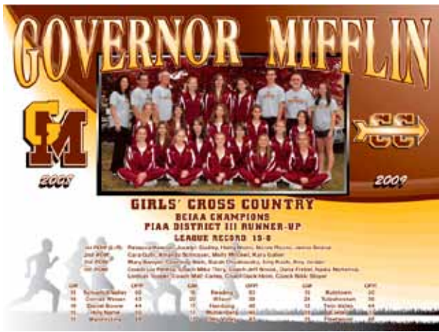
PAL 230 CRS