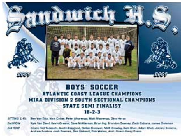
PAL 230 MASCOT