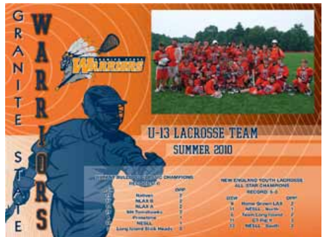
PAL 229 LCS