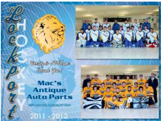
PAL 229 IHK