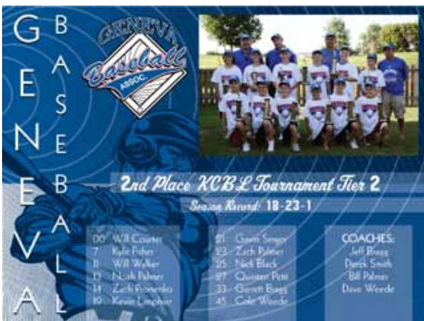
PAL 229 BSE