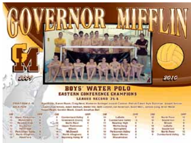
PAL 230 WPL