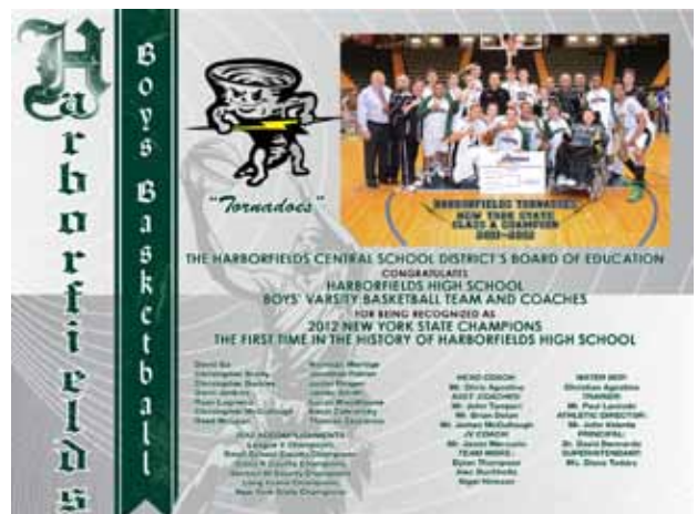
PAL 229 BSK